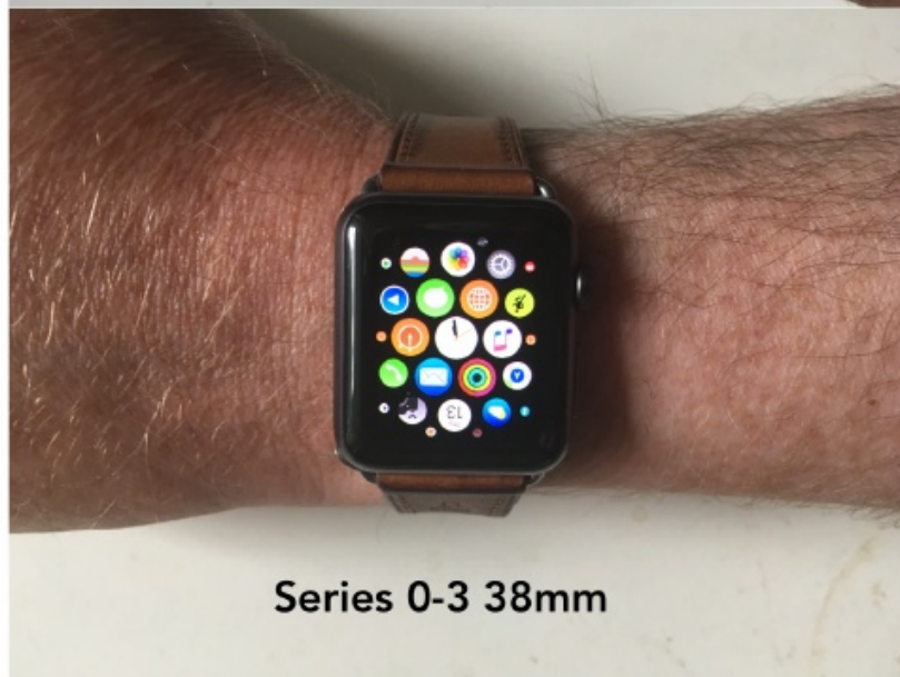
Series 0-3 38mm