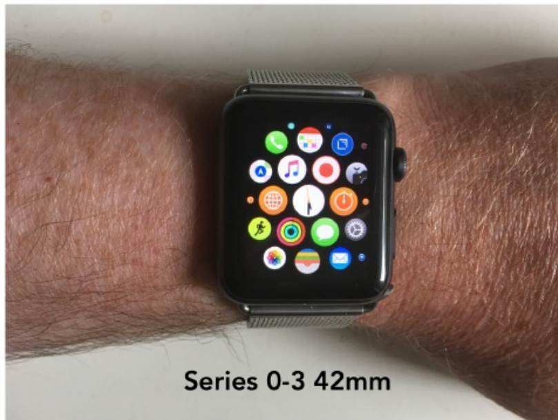
Series 0-3 42mm